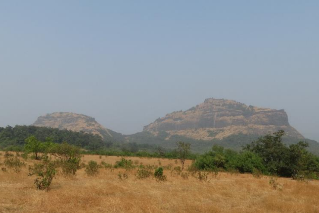
Fanasrai village on way to Rajmachi plateau and view of the two forts Shrivardhan (left) and Manranjan (right) taken from the plateau.