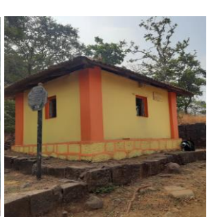
4 Major temples built along large period across the plateau, (1. Gondeshwar, 2. Hanuman, 3. Bhairoba, 4. Hanuman and Ganesh)