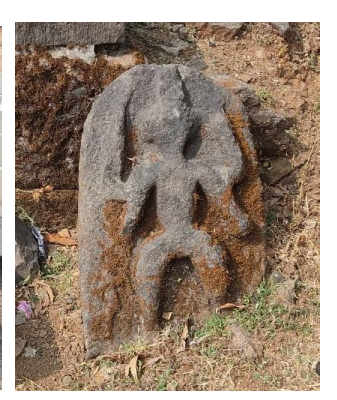
Various iconography spread across the Plateau, adding up to its cultural value.