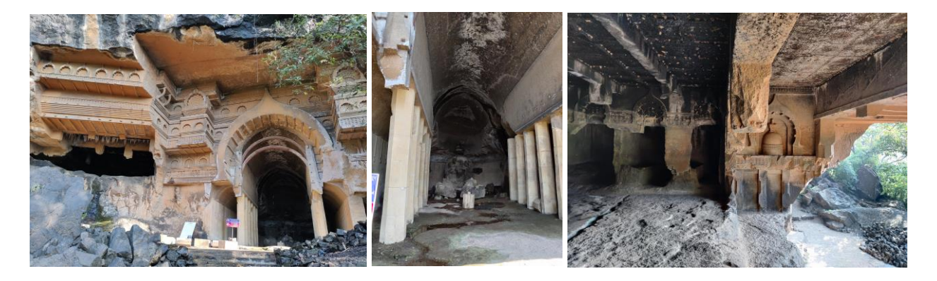
Kondhane Buddhist caves showcases one of the finest rock cut architectures of Maharashtra.