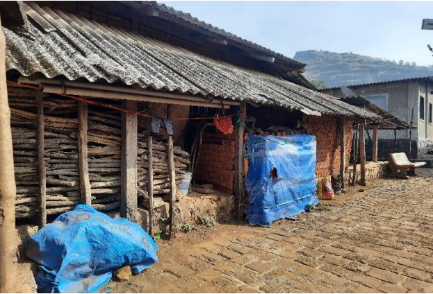
Verandah floored with cow dung finish and kata for seating, backyard extended roof for storage of large amount of wood and other ancillary things is common in these traditional houses.