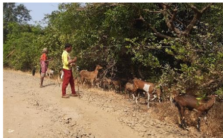
Tourism and cattle farming are the major occupation of these people with majority of people now depend on the income through tourism. Farming was practiced before but due to various challenges they had to stop. Now due to this strong context, tourism has been important aspect for income.