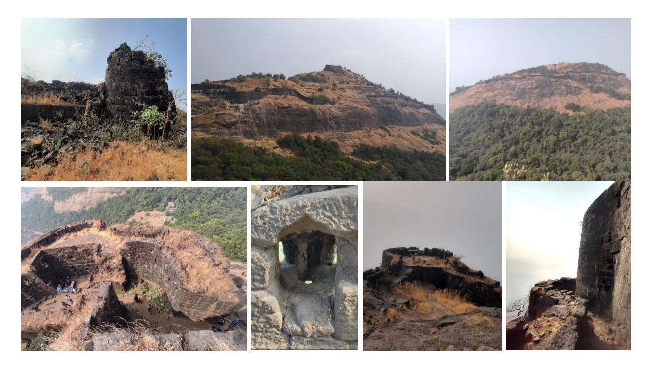
The fortified military landscape of the whole plateau astounds with the layers and magnificent construction of these fortifications across the plateau with the two citadels Shrivardhan and Manranj. Various elements like double layered bastions, triple layered fortifications, uniquely designed loopholes and concealed gateways showcases the uniqueness of this fort.