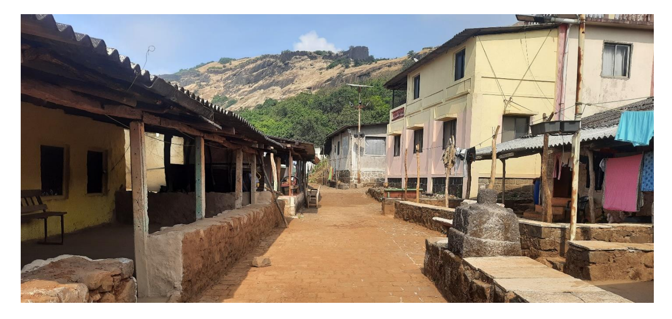
Construction of the RCC framed structures are seen growing around this traditional art of construction. (Udhewadi village with backdrop of Manranjan fort)