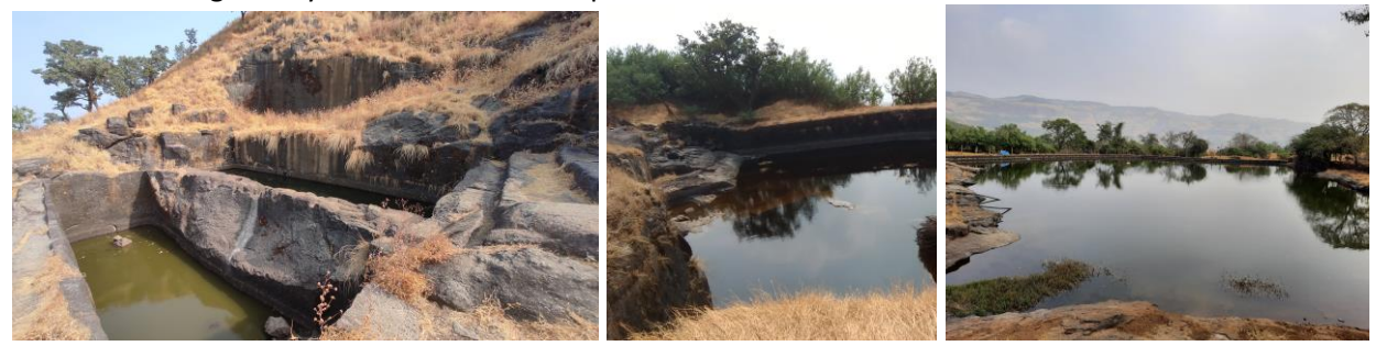
The fort has a well-planned water system in form of various tanks and lakes which even today satisfy the needs of the villagers and tourists.